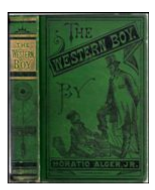
Format 01: Shoeshine