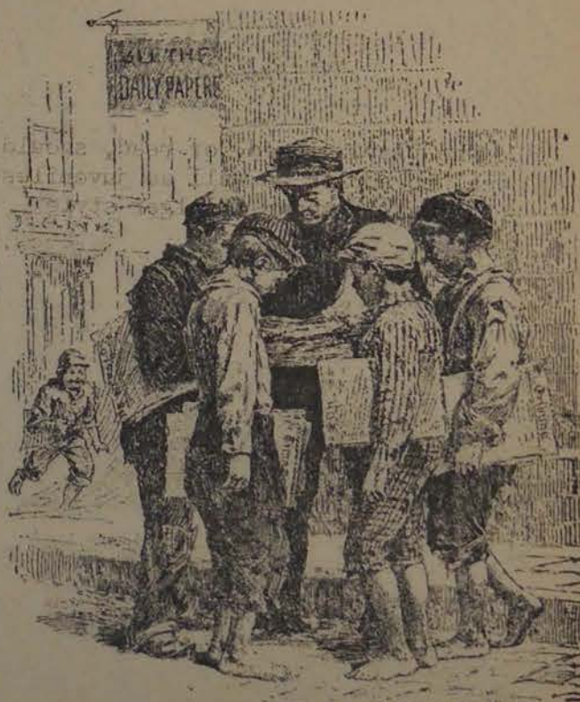
GETTING POINTS FROM THE LAST EDITION.