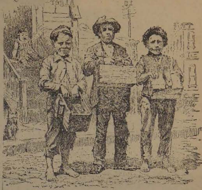
A GROUP OF BOYTHIEVES.