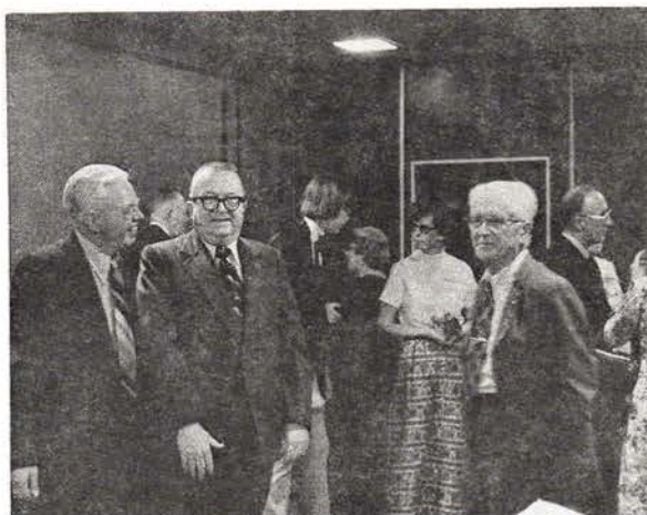
Horatio Alger Society members converse during annual banquet at Geneseo, New York.