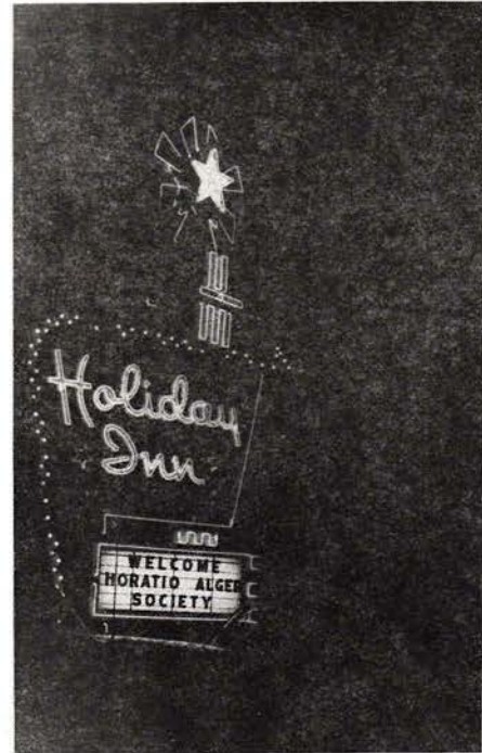
The Holiday Inn of Geneseo welcomes all HAS members.