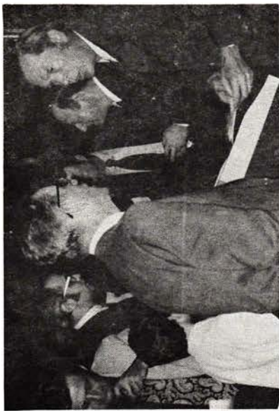
These three top pictures show scenes from the Saturday evening banquet at the Geneseo Holiday Inn.