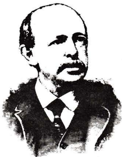
Horatio Alger Jr.

It was almost like a Horatio Alger dream story come true for Des Plaines' No. 1 fan of that 19th century author who boosted pluck and luck to highest heights of idealism.