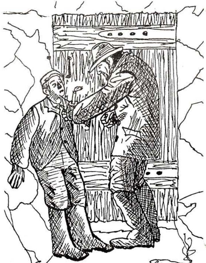
COVER ILLUSTRATION FOR MAKING HIS MARK.