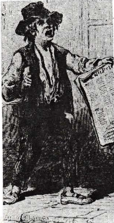
Newsboy making rounds, 1854.