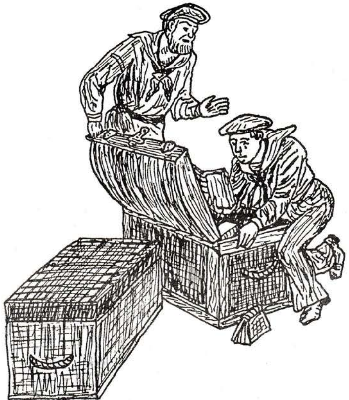
COVER ILLUSTRATION FOR WAIT AND WIN.

To save both time and money use the enclosed order form to order both titles before February 28, 1979.