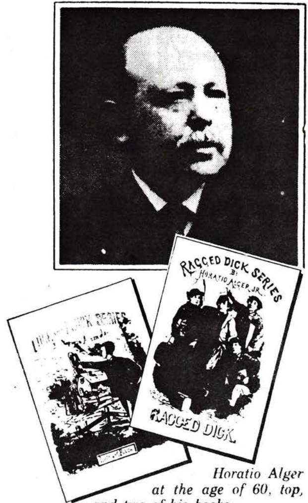
Horatio Alger at the age of 60, top, and two of his books.