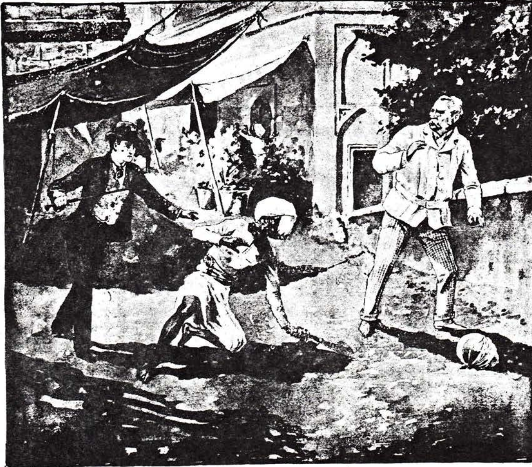
Quick as a flash, Guy sprang forward to the rescue.

Author of "Rupert's Ambition," "Luck and Pluck," "Tattered Tom," etc.