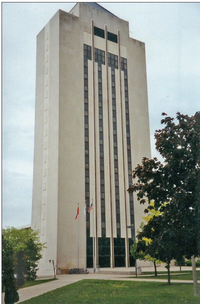
The Holmes Student Center at Northern Illinois University.