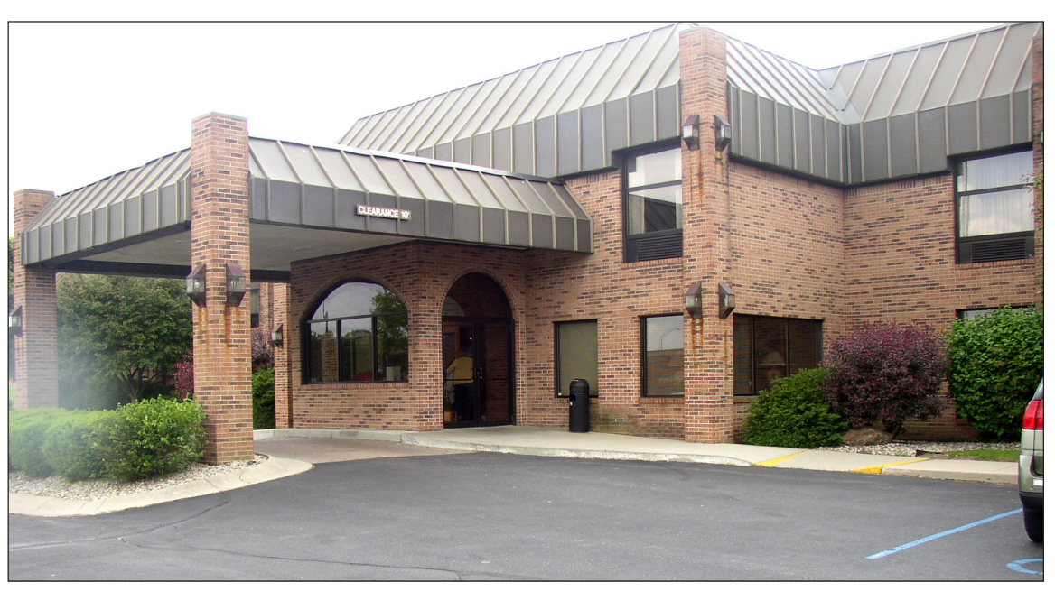
The Lees Inn, site of the Horatio Alger Society convention in Shelbyville, Indiana.