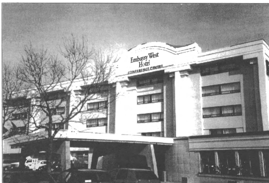
The Embassy West Hotel Conference Centre in Ottawa, Ontario, Canada will be the site of the Horatio Alger Society convention May 3-6, 2001.

We're looking forward to showcasing Ottawa and the Ottawa Valley in 2001. Won't you join us?