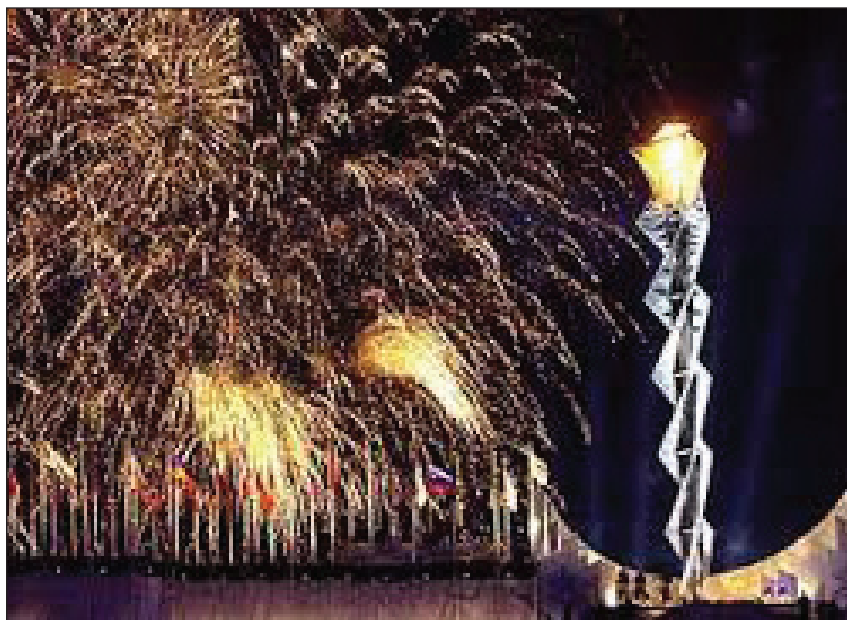
The Olympic flame and a gigantic fireworks display dominate the night sky over the stadium during closing ceremonies February 24, for the 2002 Winter Olympics at Salt Lake City. The games, which drew record television ratings in the United States and overseas, were declared by the International Olympic Committee the most successful in history.