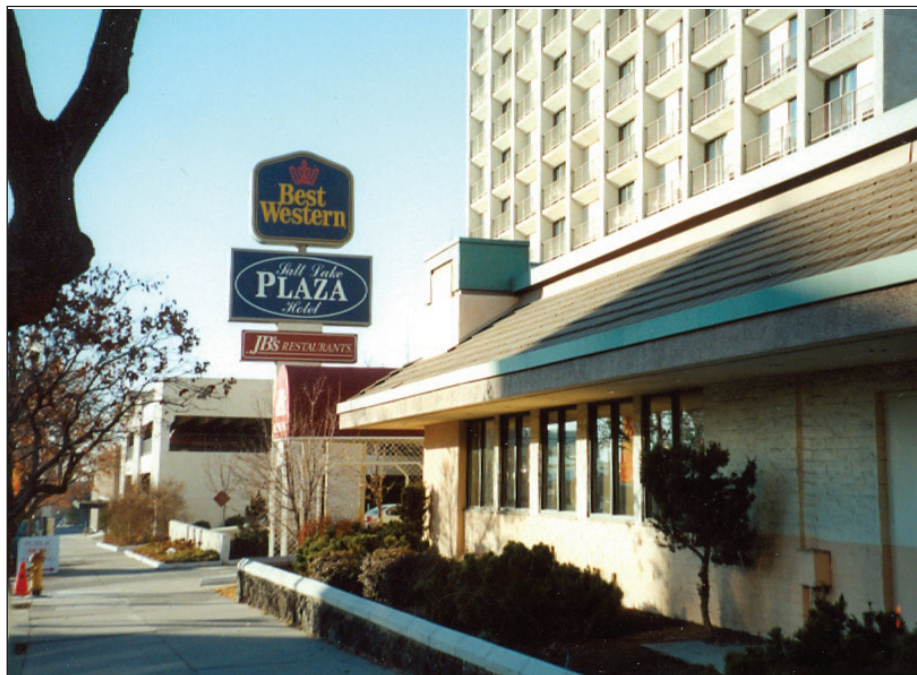
The official H.A.S. Convention hotel is the Best Western Salt Lake Plaza, across the street from Temple Square.

For more information and photos of Salt Lake City, see Pages 5, 8 and 9.