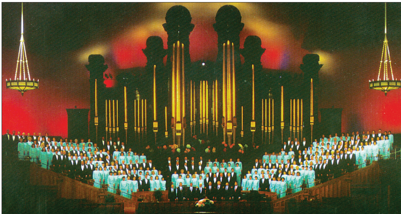
The Mormon Tabernacle Choir is one of the world's best-known choral ensembles.