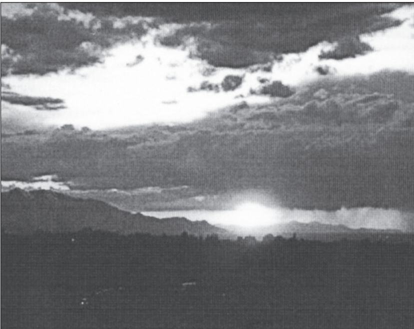
The sun sets over Utah's Wasatch Mountains as the 2002 Horatio Alger Society convention draws to a close.