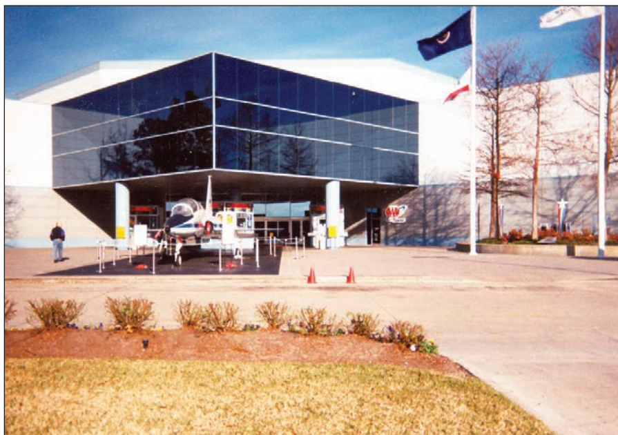
The visitors' center of the Lyndon B. Johnson Space Center is virtually next door to the Holiday Inn-NASA, host for the H.A.S. convention.