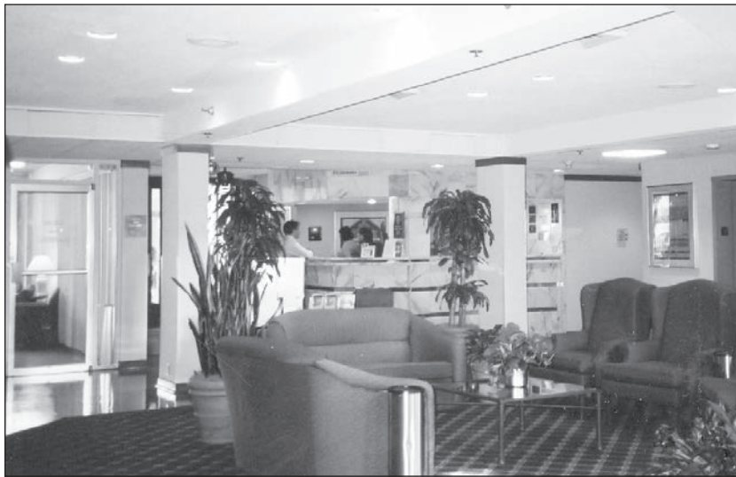
Holiday Inn-NASA, lobby and hotel registration desk.