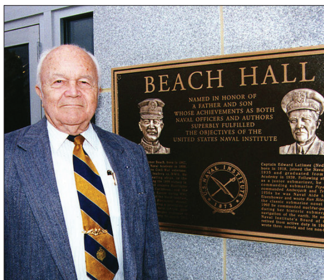
Retired Navy Captain Edward L. Beach, Jr. at the dedication of Beach Hall at Annapolis in April 1999.

During his World War II service, Beach's decorations included the Presidential Unit Citation and Navy Unit Commendation for his service on the Trigger, along with