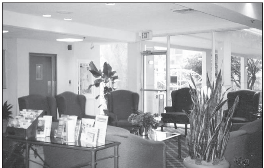
Another view of the hotel lobby.