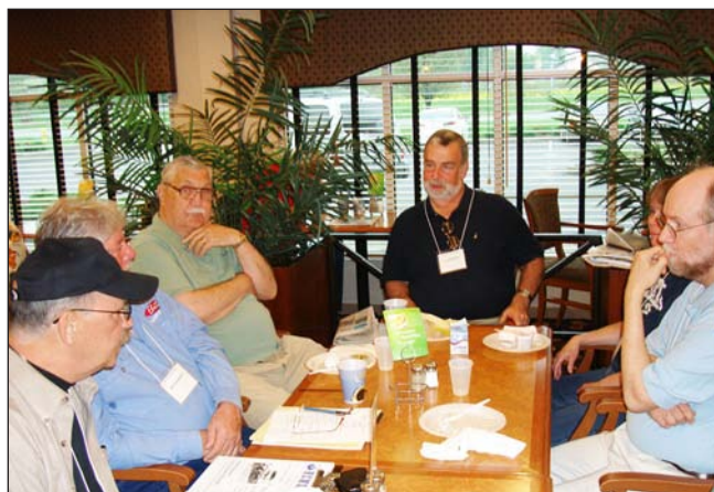
The H.A.S. board of directors holds its traditional Friday breakfast in the lounge of the Holiday Inn Express in Greenwood, Indiana.

Horatio Alger Society 1004 School St. Shelbyville, IN 46176