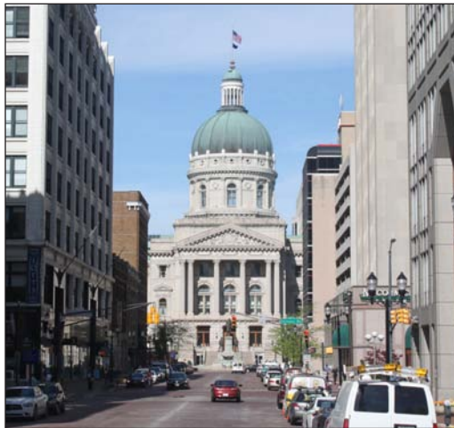
The Indiana Statehouse, located in downtown Indianapolis.